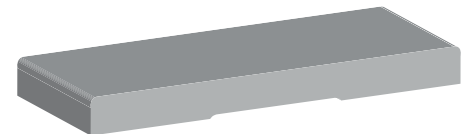
803 1/2" X 7-1/4" X 16'