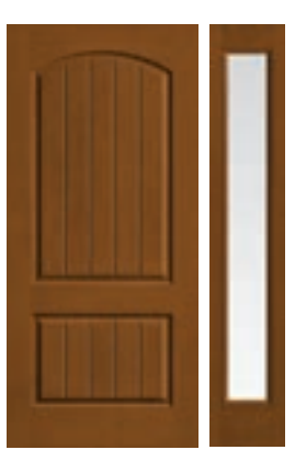
Mahogany Grain CCR205 / CCR3400SL . Stained Rustic Clay