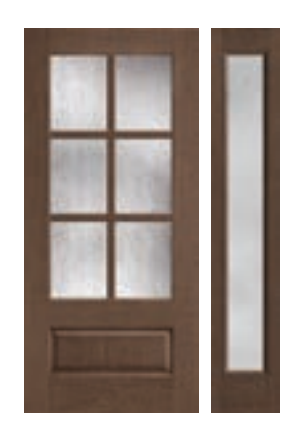
Rainglass Mahogany Grain CCM2806XF-SDLF6 / CCR3400SL Stained Driftwood