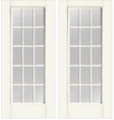
Smooth-Star. S108-SDL Painted Alpine