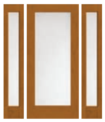
Satin Etch Fir Grain CCA2400XE ▲ / CCA2400XESL 6 Stained Wildflower Honey