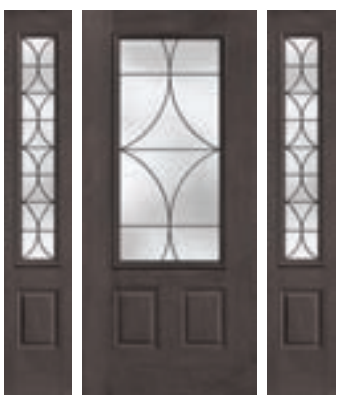
Fiber-Classic Mahogany FCM476 / FCM4525SL (1D) Stained Shale