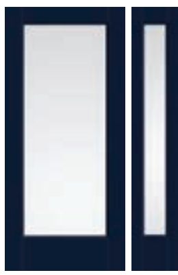
Smooth-Star. S2000 ♠ / S2000SL ♠ Painted Indigo