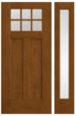
Fiber-Classic. Mahogany FCM4816-SDLF1 🌢 / FCM2000SL 🜢 Stained Rustic Clay