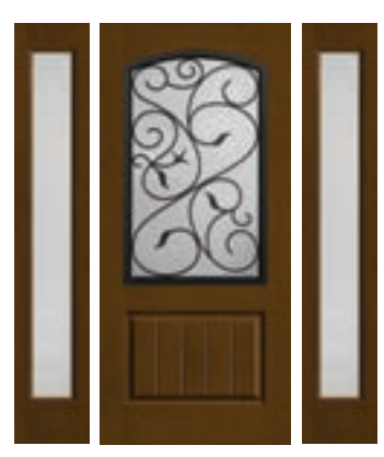
Augustine. / Granite Mahogany Grain CCR20537 (1W) / CCR3400XNSL Stained Barley