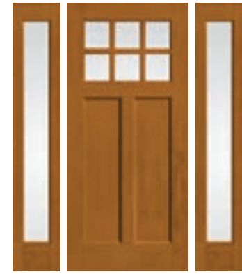
Low-E SDL Fir Grain CCA260-SDL ♠ / CCA3400SL Stained Wildflower Honey